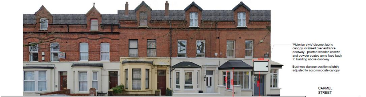
Proposed North Facing Elevation