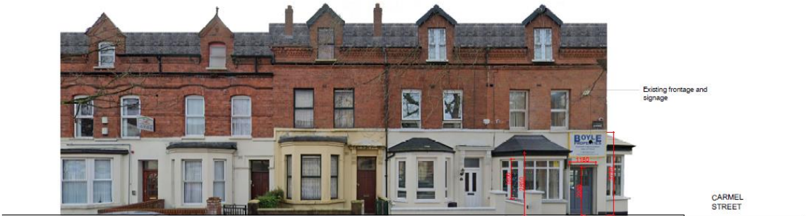
Existing North Facing Elevation