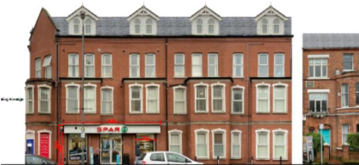
Existing North Facing Elevation