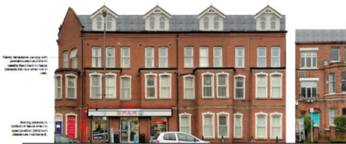
Proposed North Facing Elevation