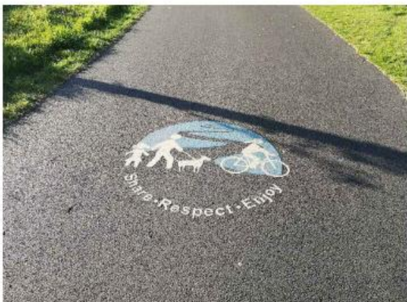
Figure 2: Example Image – Thermoplastic Waymarker