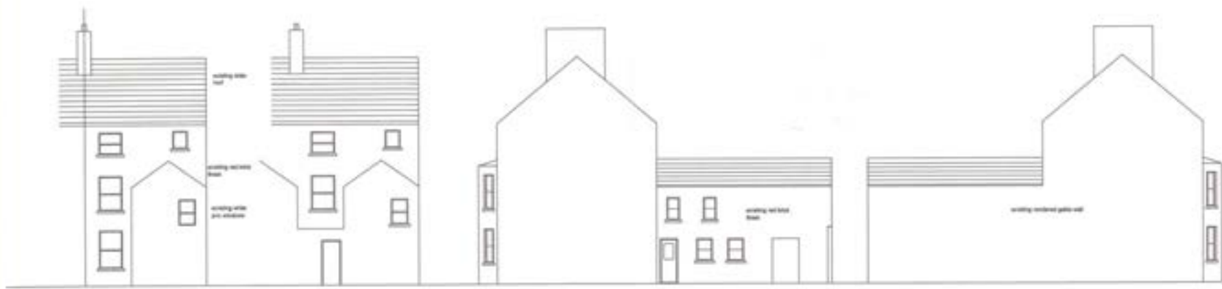
existing rear elevation within courtyard