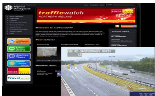
TICC's TrafficwatchNI website