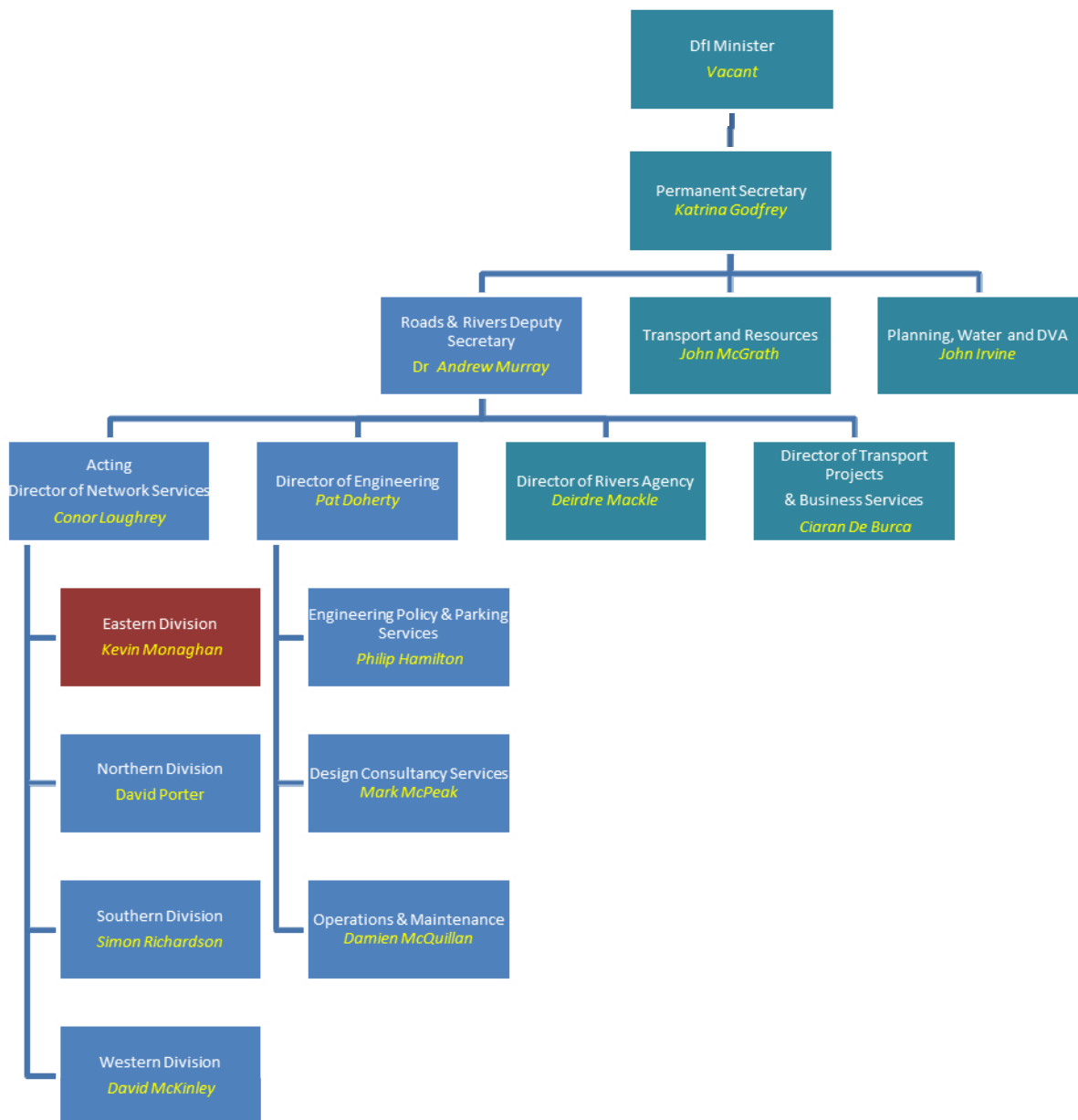
Figure 1 – Organisation Context

Eastern Division is part of the Roads structure, within the Department for Infrastructure, made up of separate business units who order services (within Network Services Directorate) and those who provide services in the Engineering Directorate (Design & Consultancy Services and Operations & Maintenance) (see figure 1 below).