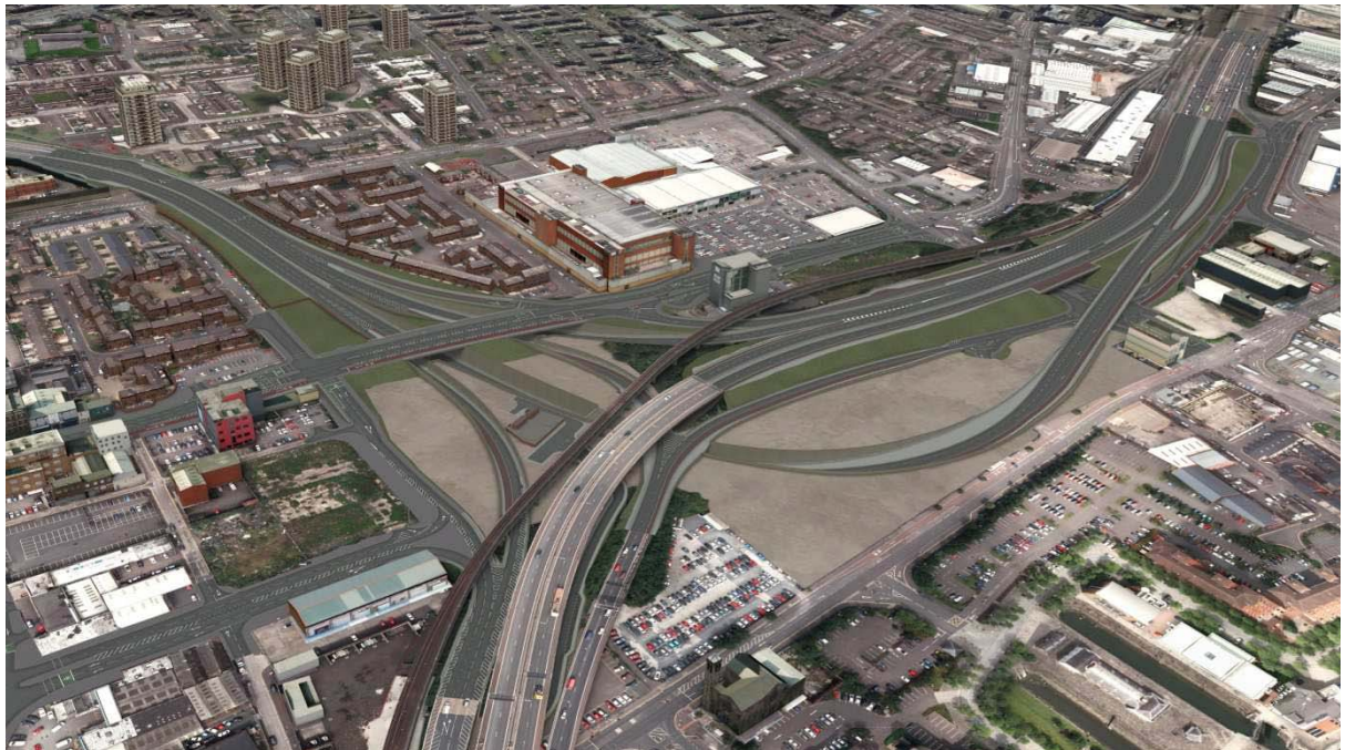
Preferred Option to improve York Street Interchange

Delivery of the York Street Interchange scheme remains a high priority for the Department. This scheme will address a major bottleneck on the strategic road network, replacing the existing signalised junction at York Street with direct links between Westlink, M2 and M3, the three busiest roads in Northern Ireland.