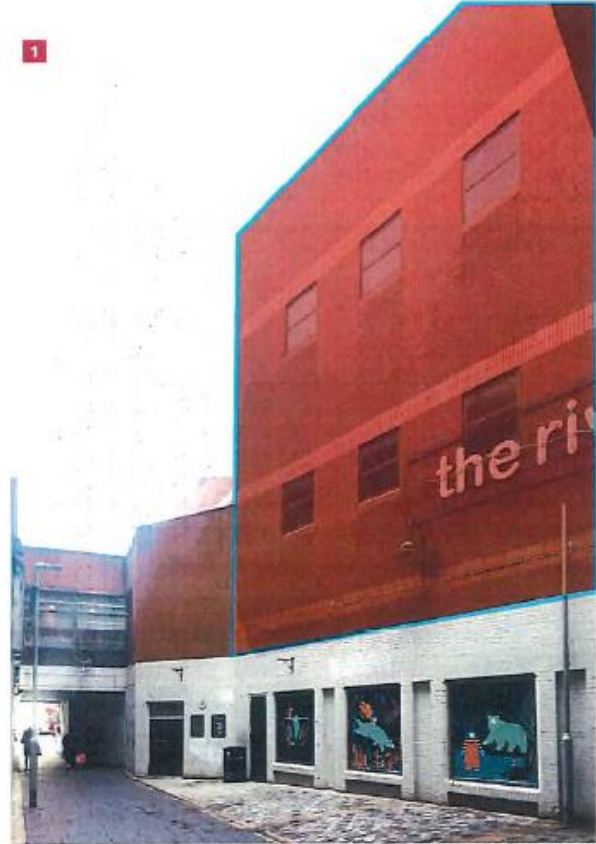
1 Large wall surface above white wall to the top of the building