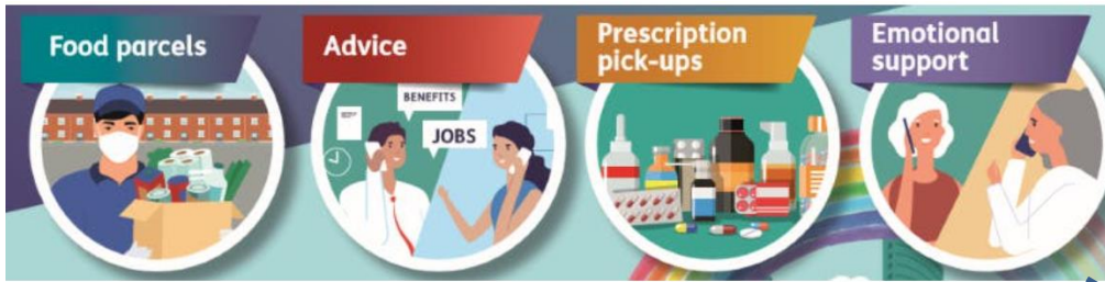
Screenshot 3: Community stories engagement tool (DRAFT)

Banner image will be updated (this is an example one)