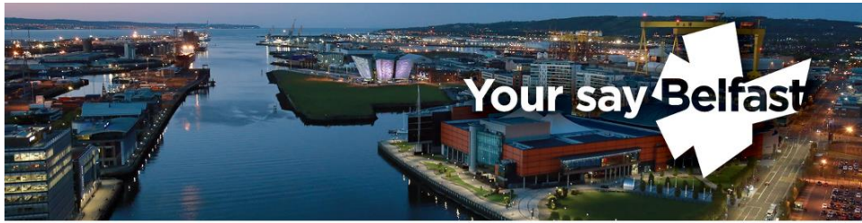
Screenshot 1: Draft front 'landing page' for the new Engagement HQ platform