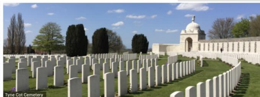
Tyne Cot Cemetery

We travel back to the UK and to your UK airport for the flight back to Northern Ireland. B