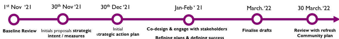
Figure 1: Action Plan development timeline.

Figure 1 below outlines an indicative timeline for phase 2, highlighting individual milestones and ensuring the action plans are developed by the original deadline of end of March 2022.